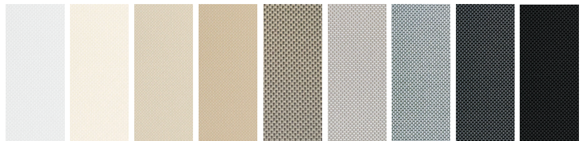
SNOW IVORY PEBBLE CINDER ASH SILVER GREY STEEL EBONY